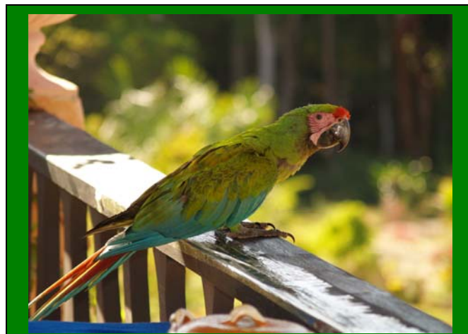
Military Macaw Help Prevent My Extinction!

A new environmental group has been formed, "Friends of the Guacamaya" to help prevent the extinction of the Military Macaw. In 1990 the estimated population of Macaws in Mexico was over 50,000 breeding pairs. Recent bird counts estimate current populations at less than 10,000 birds and declining. Poachers are robbing the nests of the Military Macaw to sell the babies each spring, and many birds die before being sold.