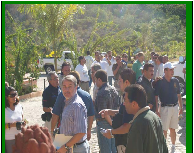
Emilio Gonzalez Marquez, Governor of Jalisco (front-with folder) and guests viewing PVBG grounds